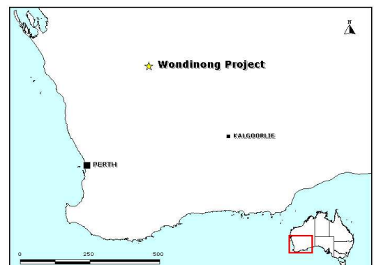
Figure 1: Wondinong Location

Figures 2 and 3 show all drilling to date on the Wondinong Prospect and highlight those drillholes with intervals over 100ppm and 200ppm U 3 O 8 and U 3 O 8 in either assays or radiometric logs over a minimum interval of 0.5m (for assays) or 0.2m (for radlogs).