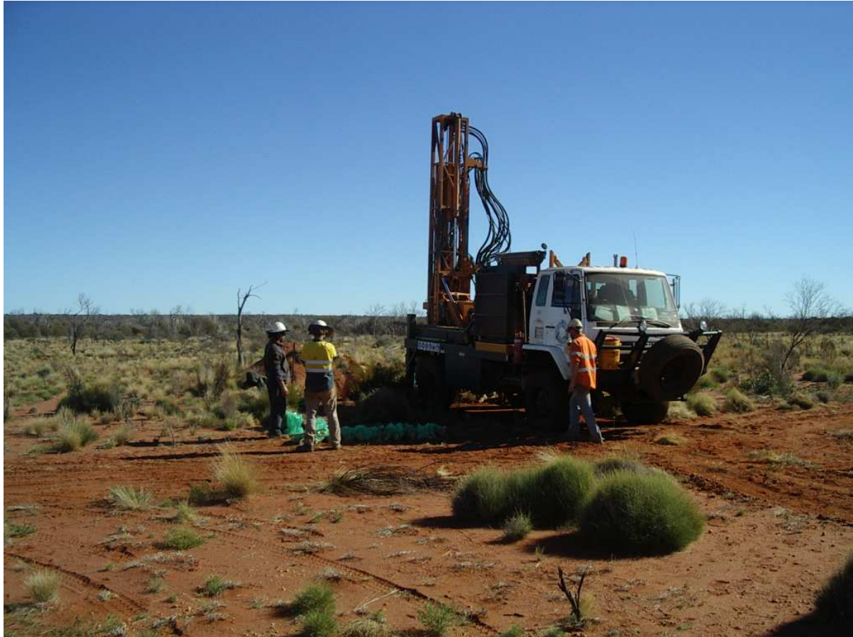
Drilling the Junction palaeochannel, July 2009